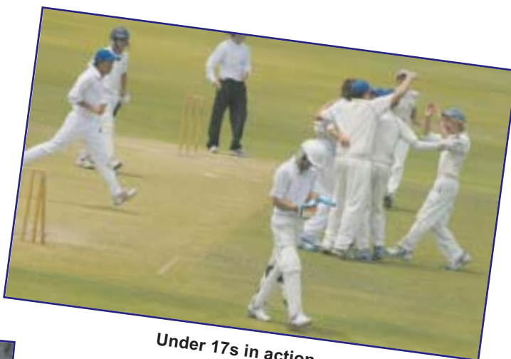
Under 17s in action.