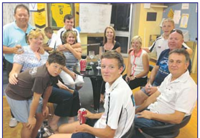
• 15s VOLUNTEERS: The 15s parents and some players enjoying the volunteers night. Whether it be scoring or organising morning tea, a fantastic group of parents always willing to put their hand up to help out.