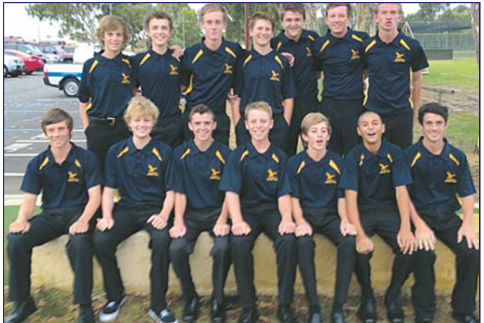
LOOKING SMART AND PROUD TO BE A HAWK: Our under 15s pictured on presentation night decked out in their Gosnells shirts and black pants. A smart group of talented young men.