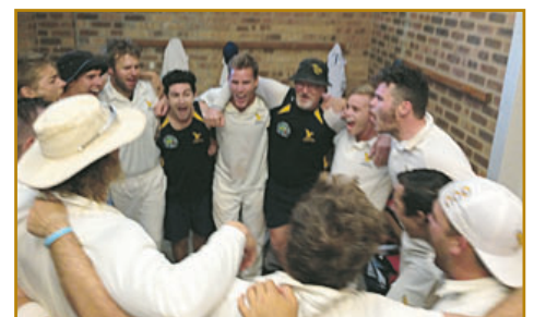
The club song was sung loud and strong on many occasions this season.

Whatever the final outcome of this year, this Club, it's players and Coaches, and it's members can now build on some hard work that has been going on for a few seasons now. There is a belief, and I expect, that there will be more sides from Gosnells participating in finals next year. We cannot however accept this year as a benchmark. We must stay together as a group and work harder still to set higher goals, and sustained long term success.