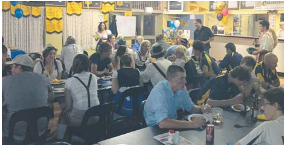
• Was a night well supported by players and members.