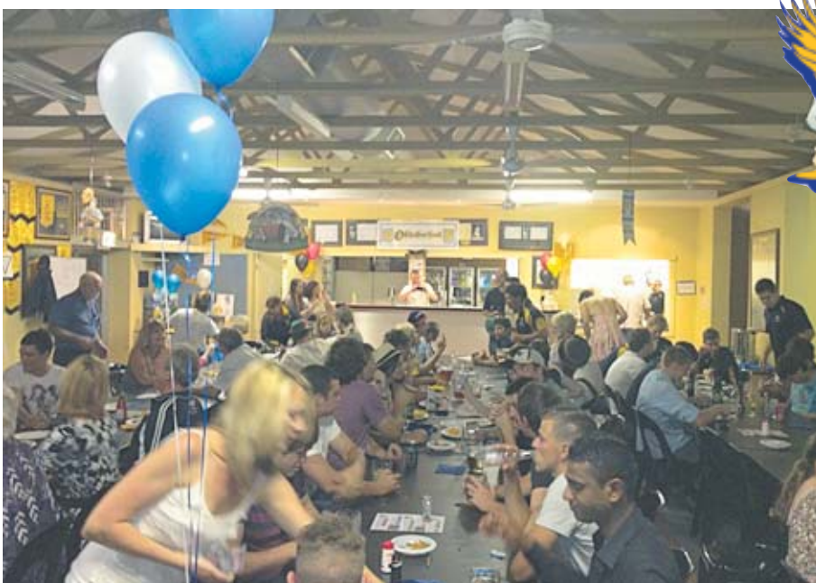
• It was a great night with heaps of laughs and fun.