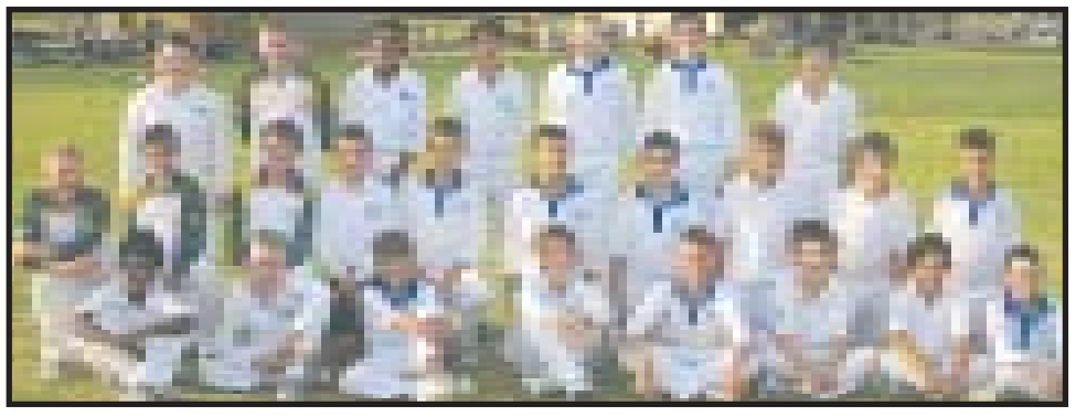
Some of our under 12 development players looking towards the Inverarity Shield squad for 2011/12.