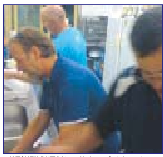
• KITCHEN DUTY: You will always find the real men in the kitchen.