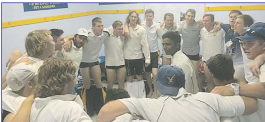
The second and fourth grades finished the season with strong wins against Claremont Nedlands.

Work for next season has started and the challenge to get back to finals is a clear focus. A unified approach and willingness to play your part, do your role first beyond all else and work towards a Club Championship that will go a long way to this cricket club achieving its goals.