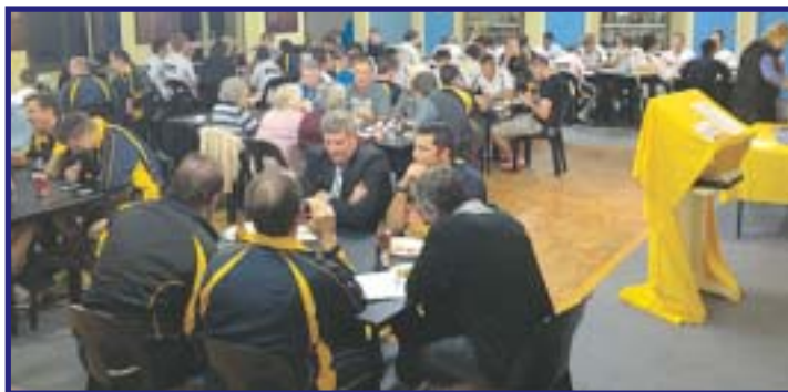
• The season was launched with the traditional players tea. Special guest was the WACA's Development Coach Geoff Marsh. Life members, sponsors and officials also joined in the night.

Needless to say, they did, and Australia won. We must be the